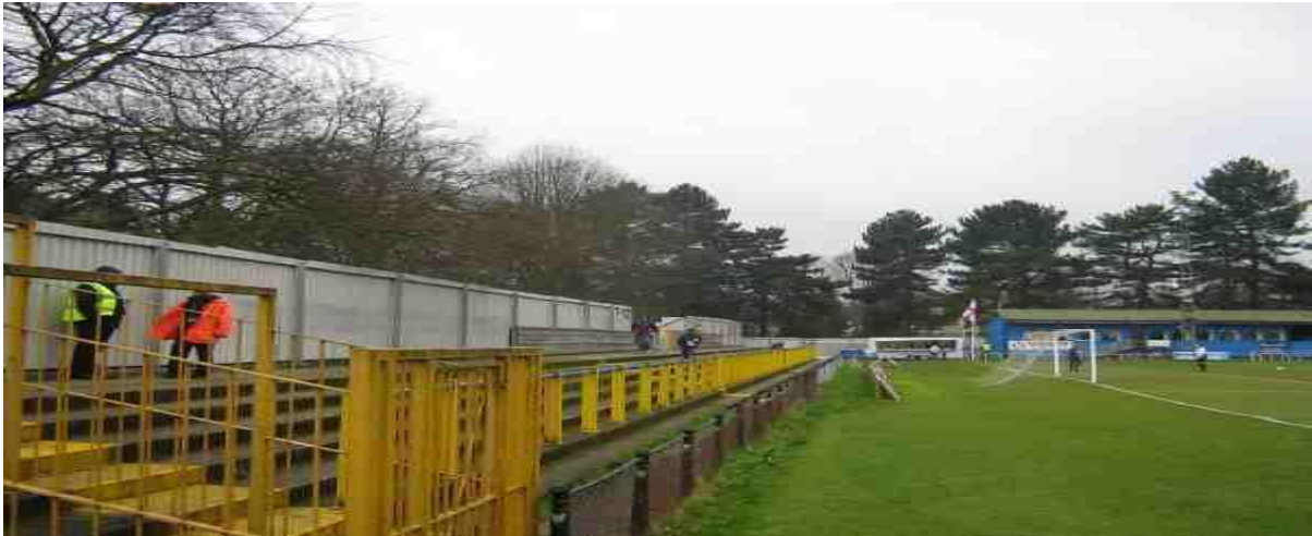
Hatfield Road of East Terrace