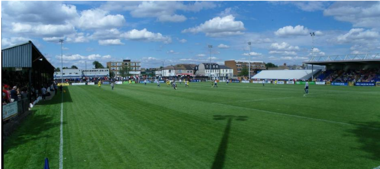
Main Stand, High Street End, East Stand

The Main Stand was built in the late 1950s by the now defunct Bexley United and was extended in the 1960s and this has now been updated to bring it up to Conference standards in March 2014 which was nearly have them sent down to the Isthmian League if it hadn't been fixed.