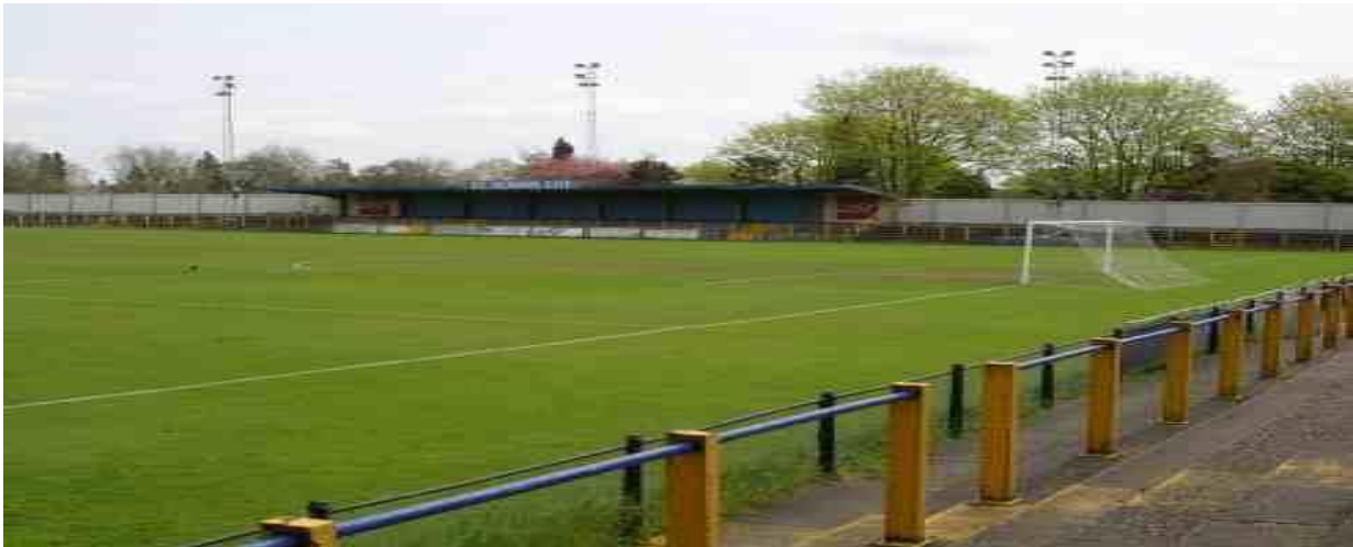
Cricket Ground Terrace

Train to St Albans City Railway Station (Thameslink) then Turn left out the station into Station Way and cross Hatfield Road into Clarence Park. Follow the path round to the right of the ground until you reach the main entrance.