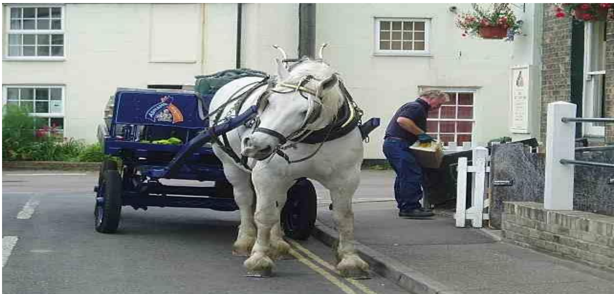
Brewery delivery at Litchfield Vaults ("mines a Pint of Bitter" says Old Wallace the horse)

The club have two bars at the ground, called Addison's and Radford's and they are both open before and after the game and welcome away fans and neutrals, except for certain derby games. Addison's is the larger and newer of the two bars and is situated behind the Merton Stand with real ales are available from the Wye Valley Brewery as well as real cider from Gwatkins where as Radford's has the added benefit of enjoying views across the ground.