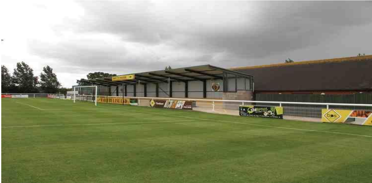
Harbury Road End

The club moved from the Old windmill Ground to the New Ground in 2000 the New Windmill is just over a Mile from the old ground in Tachbrook Rd, Leamington Spa. At the Harbury Lane End of the ground is where the Club house and main entrance are situated it is a small covered terrace. It runs for around half the width of the pitch and sits directly behind the goal. On one side is a flat standing area; whilst on the other side is a portakabin type structure that serves as a corporate facility. Opposite is the North Bank, a large open terrace.