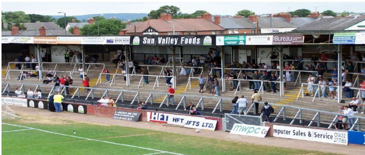
The Meadow End