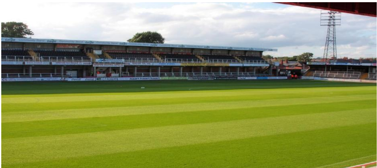
Edgar Street Stand

The Merton Stand, on the eastern side of the ground is the only all-seater stand in the ground and was built in 1968. It currently has a capacity of 1818. Initially it was flanked on either side by standing areas known as the Cowsheds , but when the club progressed into the Football League the stand was extended to cover the entire length of the pitch. The Merton Stand is the nominated family stand and includes the director's and press boxes, with matchday sponsors also seated in this stand. In front of the stand lie the dugouts next to the players' tunnel. All of the club facilities, such as offices, changing rooms, boardroom and corporate hospitality are located underneath the stand. The result of this is a number of windows at pitch level.