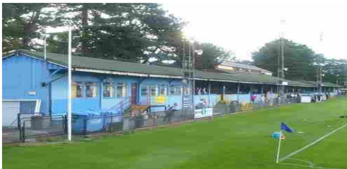
Main Stand