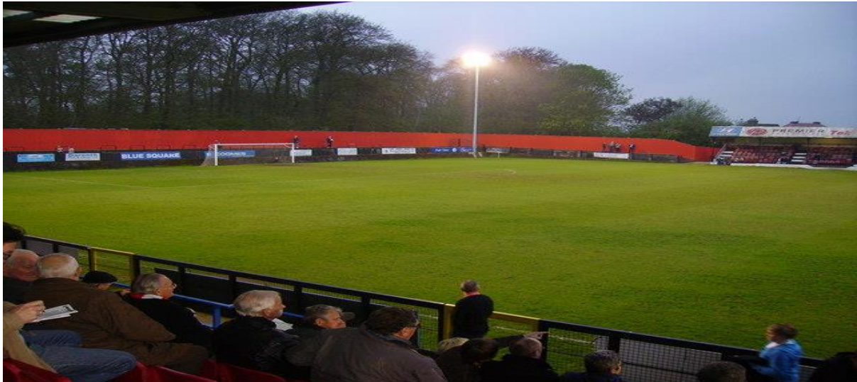
Danson Park End (Baney 92)

Both ends are open terraces. The larger of these is at the Danson Park End, which looks quite picturesque with a number of large trees behind it. Opposite is the smaller High Street End. This end is located very close to the main road and passengers on the upper deck of passing buses can see into the ground as they pass the ground. There is some netting at the back of the terrace to help prevent balls being kicked over.