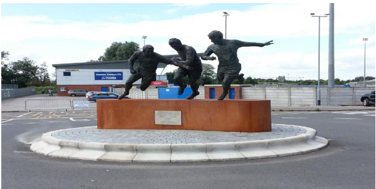
Geoff Hurst (1941 – Pd) (England), Jimmy Armfield (1935 – 2018) (England) and Simone Perrotta (1977 – PD) (Italy)

Take the M60 to Junction 23 turn left off slip road, then get into the second from left lane to go through the lights onto the A6140 sign-posted Ashton. Keep on the A6140 until you come to a set of traffic lights with a cinema on your right, turn left at these lights, follow road over a bridge then over a mini-roundabout then turn left after the mini-roundabout. Ground is at the bottom. Free car parking is available with six disabled spaces. There is also a large 'Over-Spill' car park located on the left at the beginning of the approach road to the stadium.