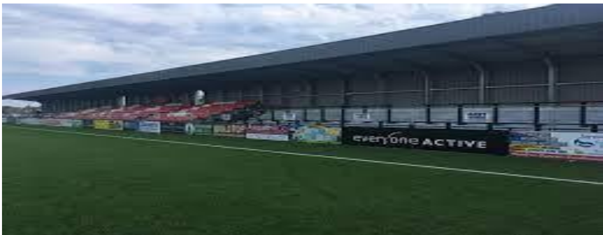
Ashburn Road Main Stand and two new enclosures

Take the A1 to Junction 49 then take a left to A168 then at the first roundabout go straight on and at the second take the second exit and continue on to Thirsk and at the roundabout take the first exit and at the crossroads roundabout take the third exit onto Sutton Road and take it to Helmsley and at the Bond roundabout take the third roundabout and then at the next roundabout at East Ayton onto Racecourse Road and continue on into Scarborough and just past the Crown Arms roundabout take a right at the Newton Arms lights and second left into St James Road and at the roundabout take the first exit at the mini roundabout then after the railway bridge take a first left and the ground is on the left.