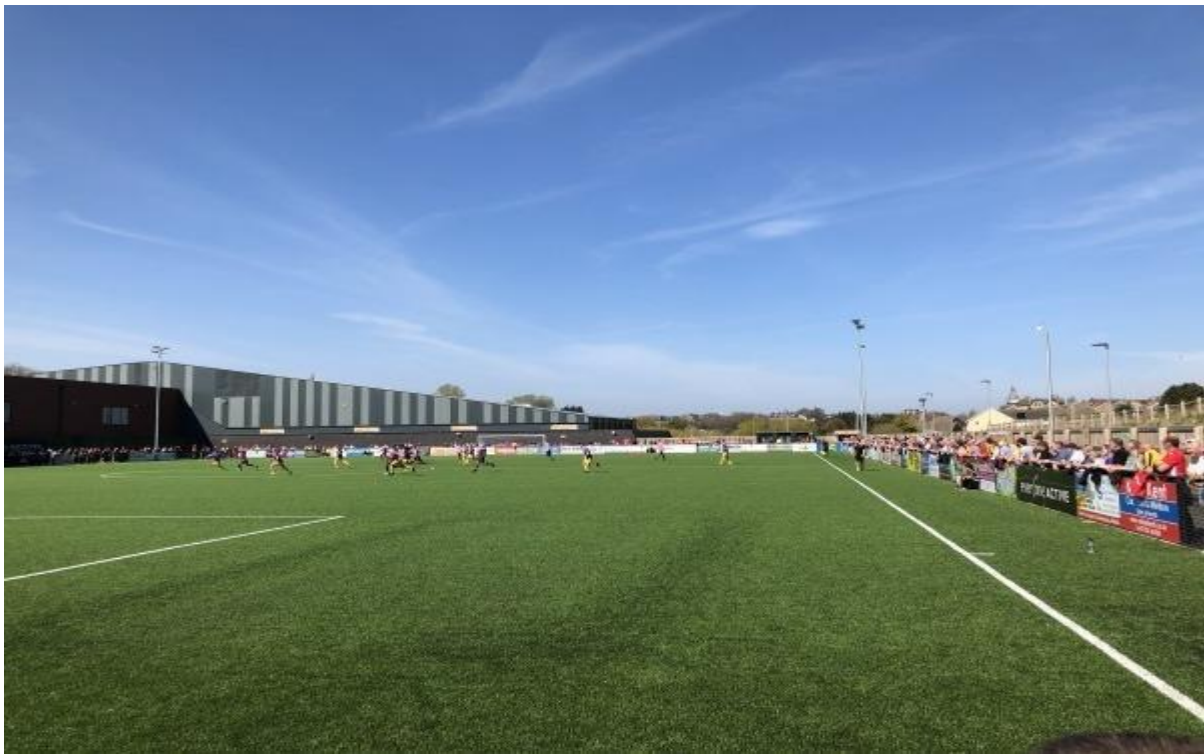
St Margaret's End and Car park Ends