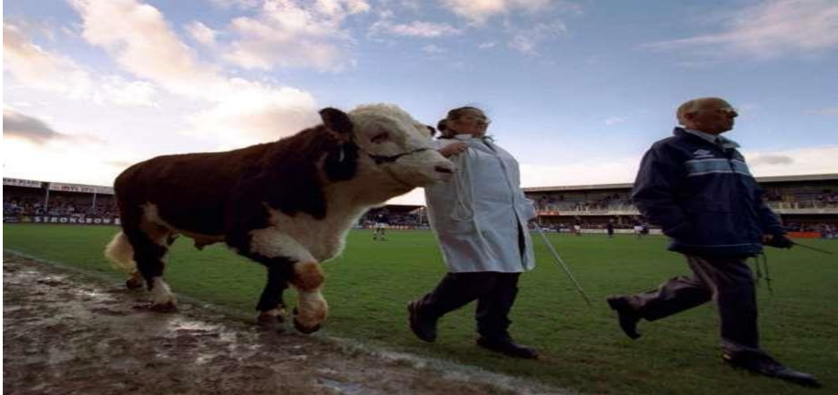
The live Hereford Mascot

through two roundabouts on the A49 till you reach Hereford. At the roundabout, take the Greyfriars Bridge/ Victoria Street Road (A49) then at Steels Garage, keep left into Edgar Street. Take Blackfriars Street (right) immediately before the football stadium. Turn left for parking.