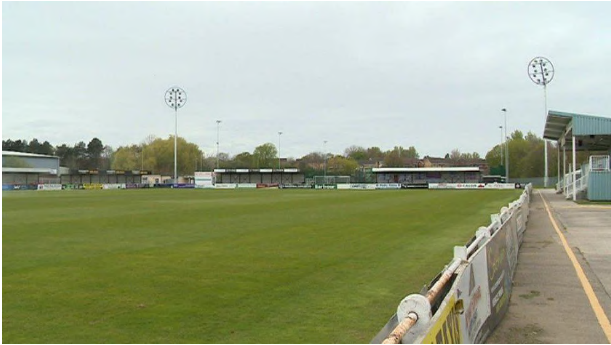
Shaftsbury and Beechgrove ends

From the South: Take the A1(M1) till Tyneside then take the right lane and merge onto the A194 and at Horshoe roundabout take the second exit and straight on at the next then take the B1516 for Jarrow/South Shields and at the roundabout take the third exit onto Roman Road and follow the road right and at the roundabout take the third exit onto Leam Lane and go straight on at the next roundabout into Hadrian's Road and at McDonalds take a left and the ground is on the right after 300 yards.