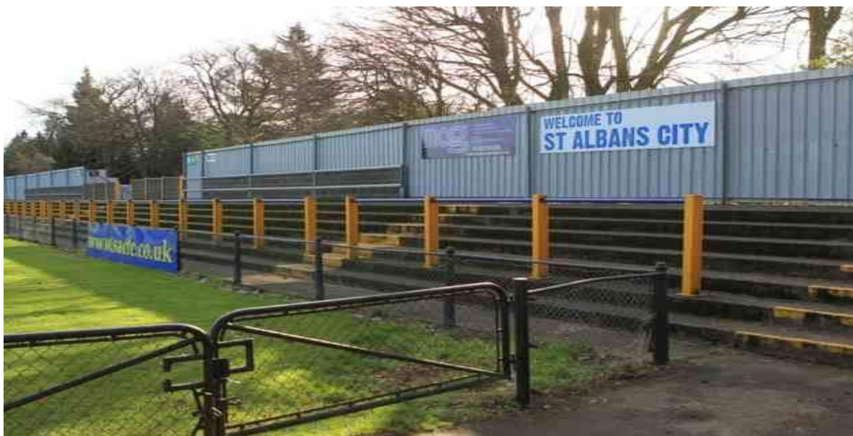
York Road Terrace